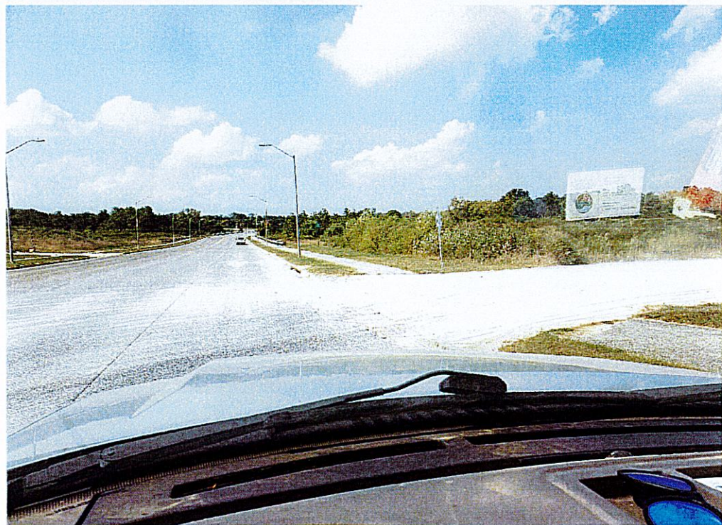
Figure 5: Dust Track out