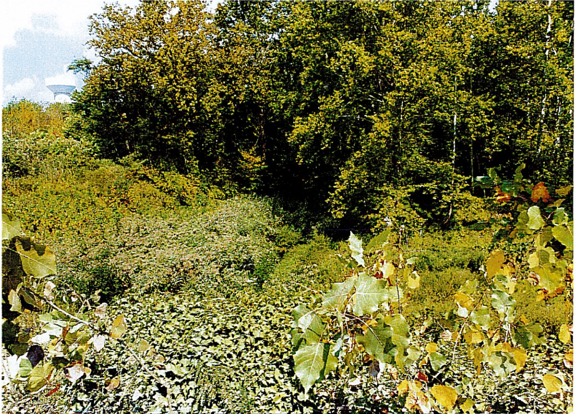
Figure 4: Sediment Basin