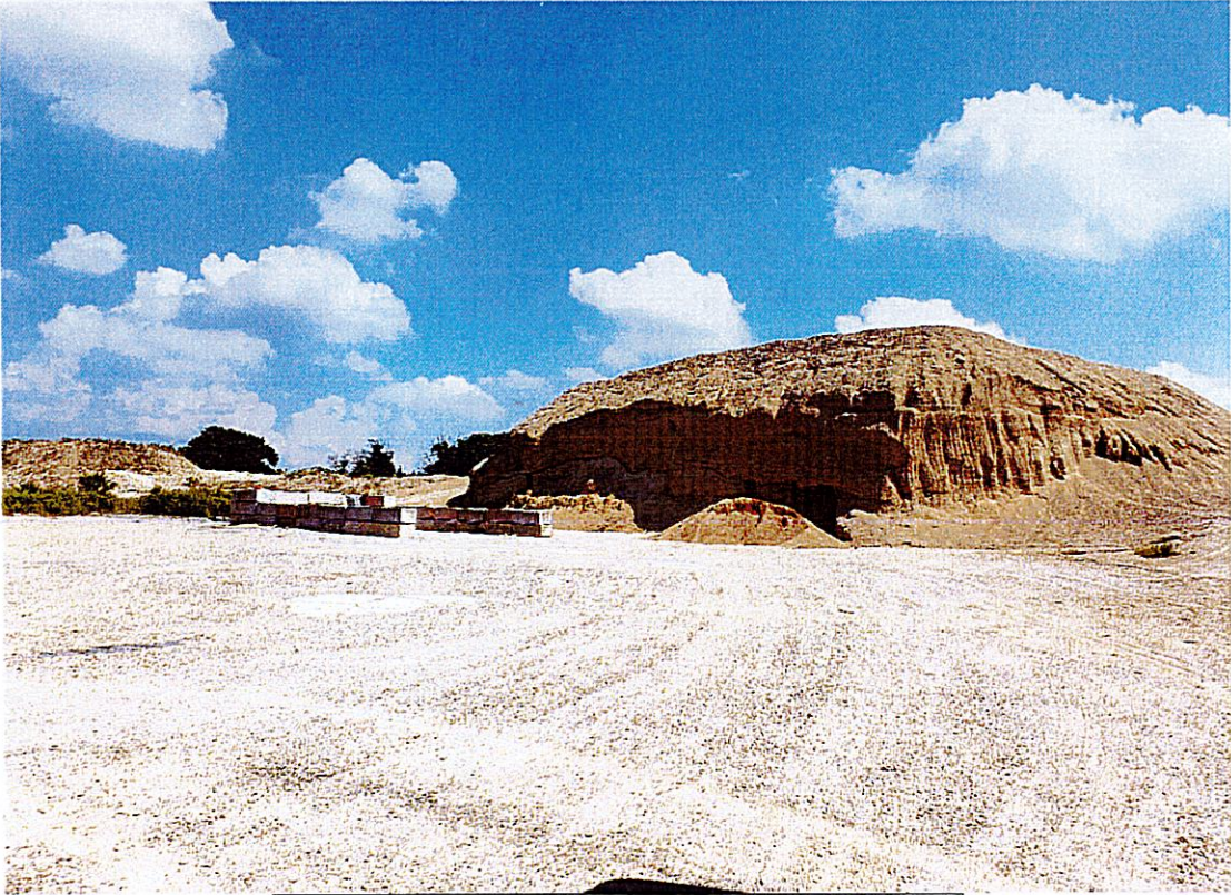
Figure 3: Crushed concrete stockpile