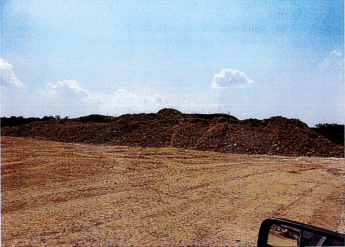
Figure 2: Material Stockpile